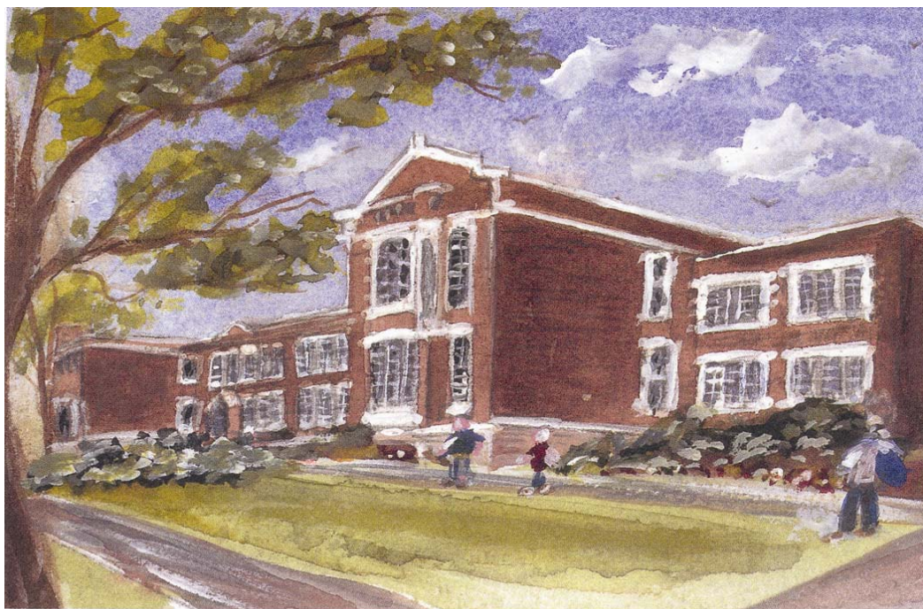
Daniel McIntyre Collegiate Institute

Mailing address: DMCI AACE Fund, Inc. P.O Box 2475 Winnipeg, MB R3C 4A7